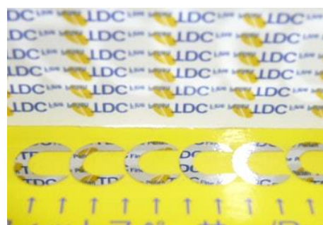
Surface Roughness Ra 1nm

TDC developed a “Mirror fit spacer” with mirror polished surface, not affecting the volume of variation in assembling equipment, contributing to the stability of dimensions.